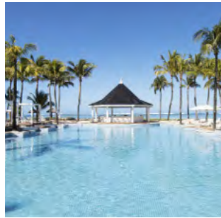
Heritage Le Telfair